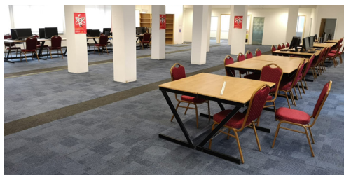
Reuse of carpet tiles in a commercial setting