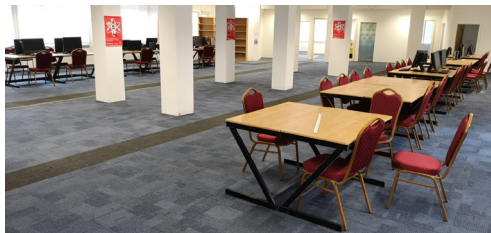
Reuse of carpet tiles in a commercial setting